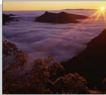
The Viking from Mt Howitt

T he Crosscut Saw is perhaps the best known walk but a quick glance at the map will show that there are many other walking tracks branching from it. If you stick to the main tracks you will spend most of your time walking through open snowgum forests or above the tree line so apart from some steep grades the walking is generally quite easy. Most people underestimate the altitude changes along The Crosscut Saw and discover that it is harder than it looks on