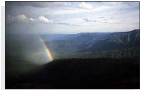
The Wonangatta Spur and Devil's Staircase from Mt Speculation

W hile not shown on this map, the walking track extends across to The Viking and it is 'possible' to do a circuit walk of Howitt - The Crosscut Saw - The Viking - Zeka Track but it includes a lot of altitude changes and some dense blackberries around the Wonangatta River.