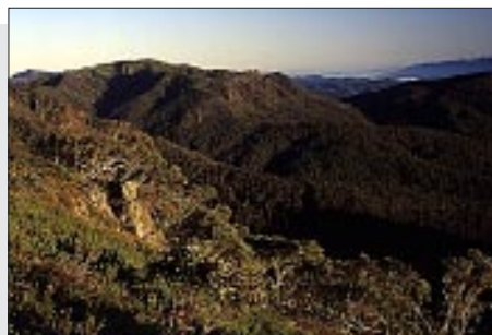
Mt Speculation from Mt Howitt

A nother option is the Upper Howqua Road but this really is a long drive across potentially snow covered mountain roads. It begins near the toll gate to Mt Buller and circles around.