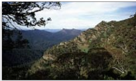
The Devil's Staircase and The Viking

T he map (page 2) is redrawn from the Howitt-Selwyn 1:50 000 map (Vicmap 8223-N) and shows 100m contours, roads, walking tracks and the main creeks and rivers. It should be used as a guide only. Virtually all tracks are closed during winter.